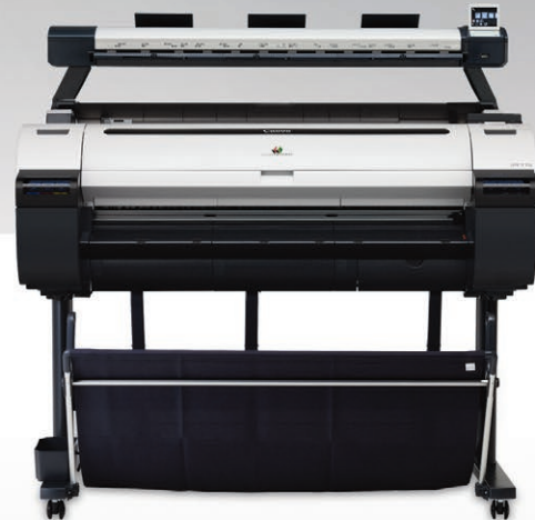
iPF770 MFP L36