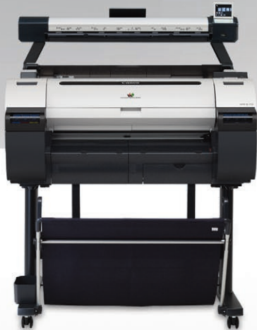
iPF670 MFP L24

Accounting Manager: This management tool easily helps track costs and allocate consumable expenses to projects. It also allows you to track print jobs by user to calculate ink and media (PC only).